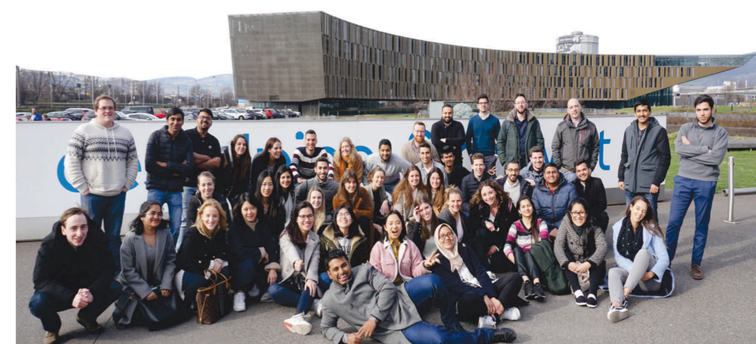
80+ INTERNATIONAL LINKAGES ACROSS THE GLOBE