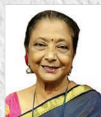
VIDHUSHI SASWATI SEN Kathak Exponent & Sangeet Natak Akademy Awardee